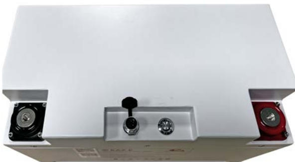
Integrated Circuit Breaker

SMART WATCH circuit breaker for intelligent standby. The EAZ-E battery features a BMS that measures, maximizes and limits the charging current to 40A without interruption without overheating your electrical installation.