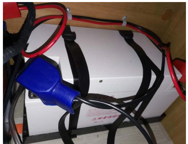
AFTER: EAZ-E battery installed