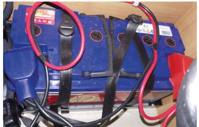
BEFORE : lead battery installed